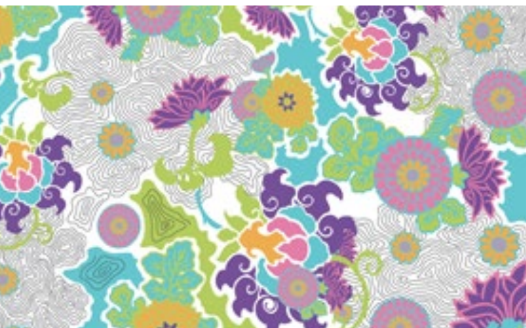
TEXTILE DESIGN BY VICTORIA BISHOP

Extend your creativity and learn visual art and graphic design techniques with a range of mediums to enable you to create exciting and unique artworks and designs which can be used commercially.