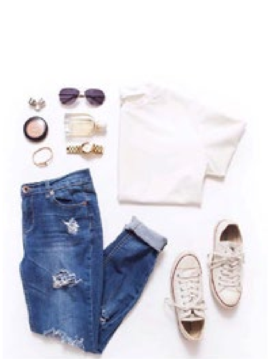
FLATLAY STYLING BY LILY PRINGLE

Note: the full details of each course are available on our website (see link at top of each Department page).