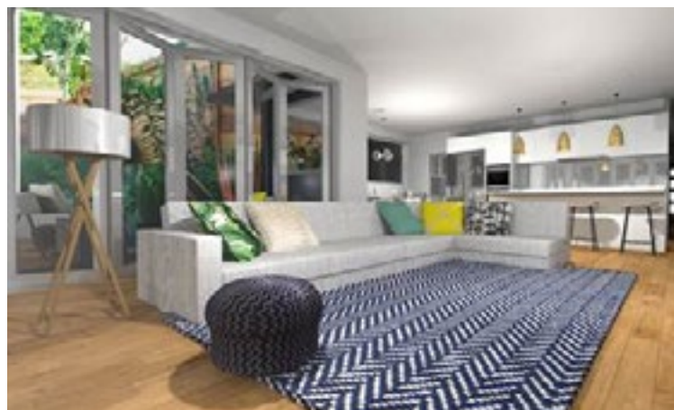
INTERIOR DESIGN BY RAQUEL WYS