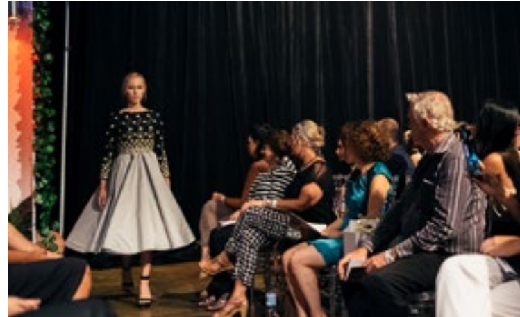
"THE NOVEMBER ISSUE" FASHION PARADE

Fashion design is more than just drawing gorgeous dresses! Opportunities in the fashion industry lie in many more areas, so we teach you not just how to design, but also every step of the production process from creation to marketing and more.