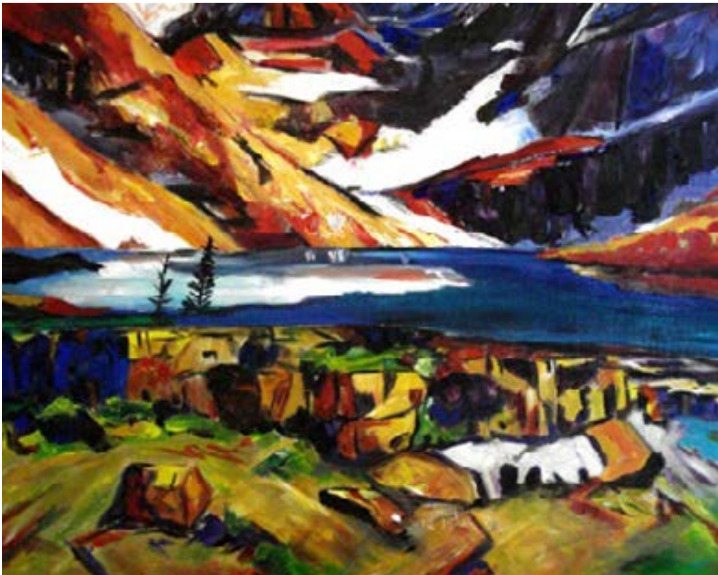
PAINTING BY GRADUATE CLAIRE LEGGATT, DIP.V.A.

These courses generally run for 1 day per week on Fridays, allowing students to be released from school on those days to complete the qualification.