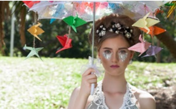
STYLING BY JESSICA RUNGE

Fashion Styling is an exciting career path. But there is much more to it than being able to put together an outfit! Stylists have to put their hand to a wide range of skills, need a creative flair and eye for design, and must stay up to date with the current fashion trends.