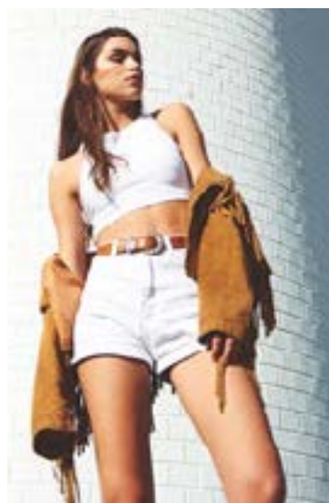
STYLING BY ???